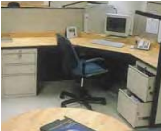
TABLE DRAWER FILING CABINETS